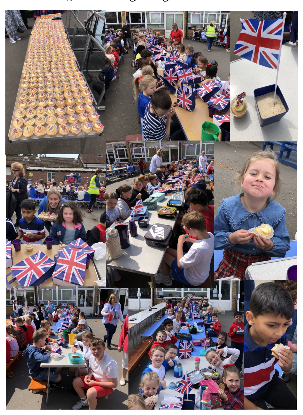
A BIG thank you to all the staff who helped to make this event possible and a special thank you to our PTA Co-Chairs whose help was invaluable.